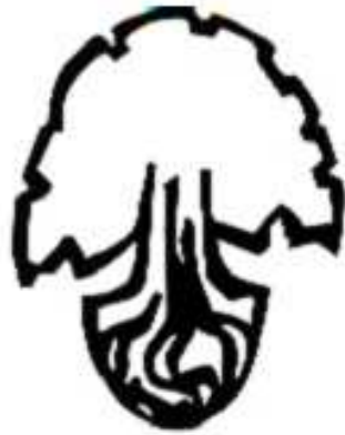
Fig Tree Pocket State School